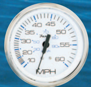
Chesapeake SS White