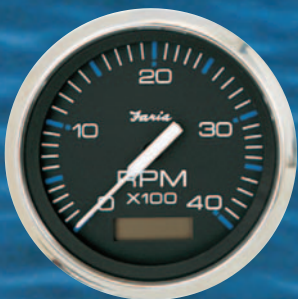
Chesapeake SS Black