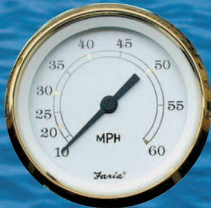
Heritage - Gold