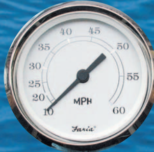
Heritage - Silver